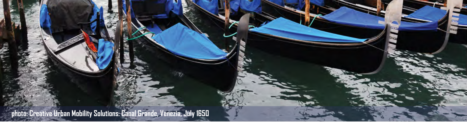
photo: Creative Urban Mobility Solutions: Canal Grande, Venezia, July 1650